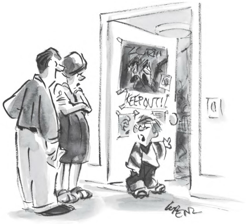
“Freedom’s on the march everywhere but 114 Circle Drive.”

After the lecture, I walked with Weiss back to his office, which is near the center of the Yale campus, in the Hall of